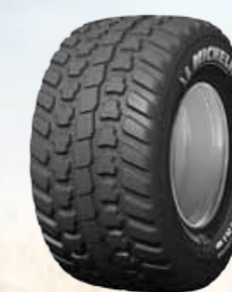
Michelin CARGO X BIB High Flotation