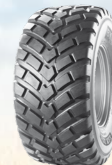
BKT RIDEMAX FL 693 M