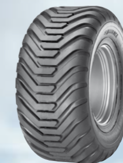
Alliance Flotation 328

Large-volume tyres reduce the tractive power requirement and prevent soil compaction even under wet conditions. The relatively large contact area minimises rolling resistance so the tyres keep rolling even under difficult conditions.