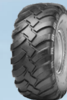
BKT FL 630 Super